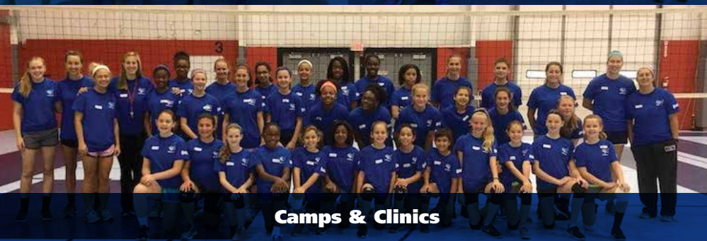
Camps & Clinics