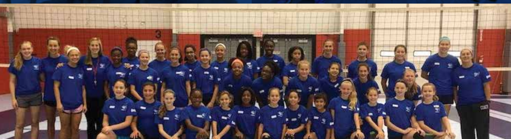
Camps & Clinics

2 Locations North Charlotte South Charlotte